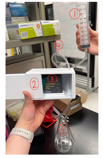
Figure 3. Model of device with light sensor and syringe